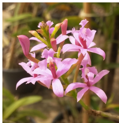
Image 2. Flowers of Epidendrum secundum .

Chart 1. Means of seed viability (%) for each treatment. MSV1 and MSV2 are means for each of the two parts of the treatments. (s) represent self-pollination and (c) represent cross-pollination.