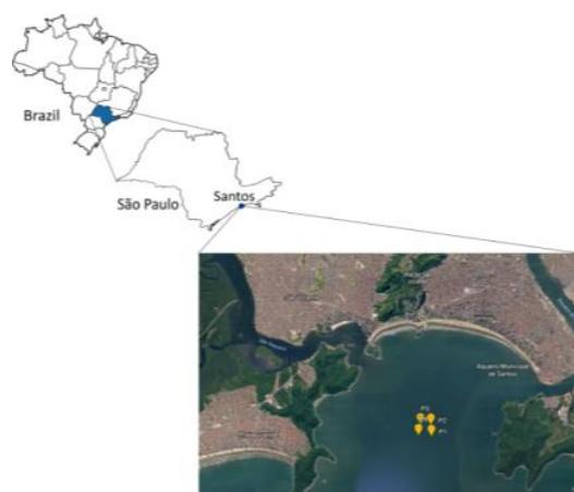
Image 1. Sites where the samples were collected.

Samples were collected at four different sites in four sampling campaigns and were evaluated as fresh sediment, dry sediment (45°C), aqueous fraction (elutriate with sediment and water, 1:4 (w/v), and organic extracts (2.5DCM:1MeOH). Liquid samples were tested using 96-wells microplates 1 , and the sediment using 12 wells-microplates containing sediment and salt water in 1:4 (w/v) 1,2 . Neonates (< 7 days old) P. hawaiiensis were used and placed individually in each well. From samples analyzed, fresh sediment presented a toxicity for 72% of samples, while dried sediment was toxic for 78% of samples. Besides, all aqueous fraction were negative and organic extracts were toxic for 71% samples.